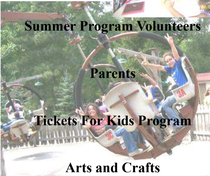
Summer Program Volunteers