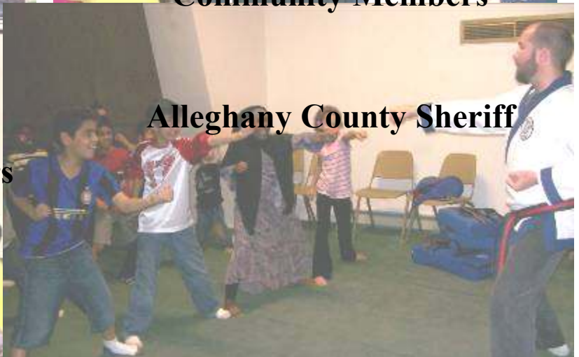
Alleghany County Sheriff