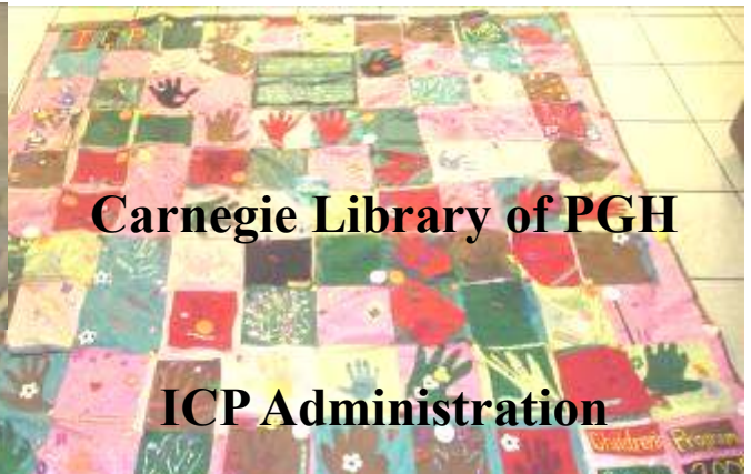
Carnegie Library of PGH